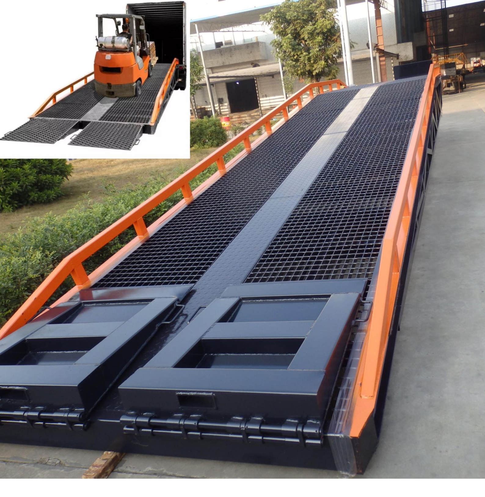
MOBILE DOCK RAMP